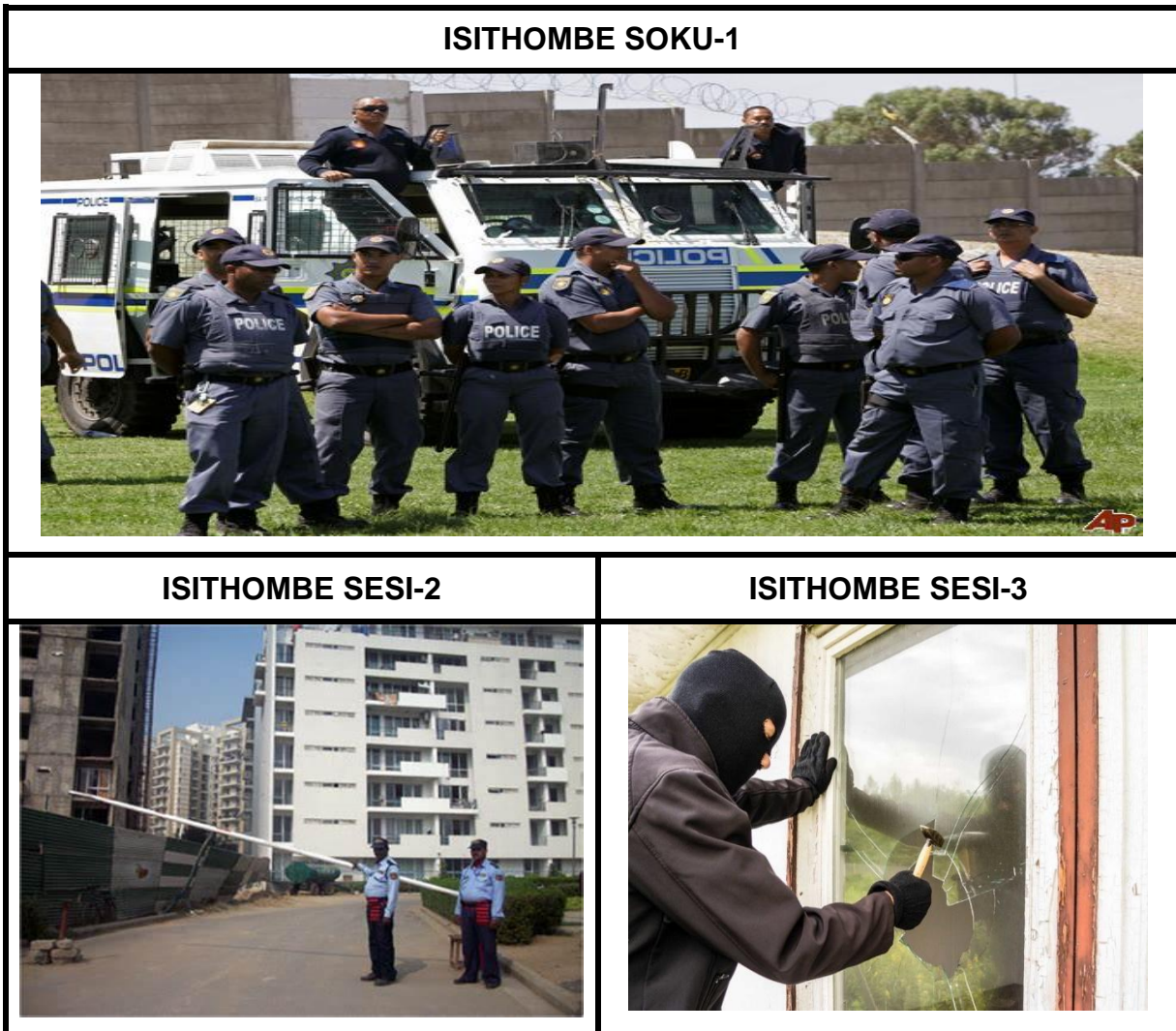
[Izithombe zithathwe kwi-inthanethi]